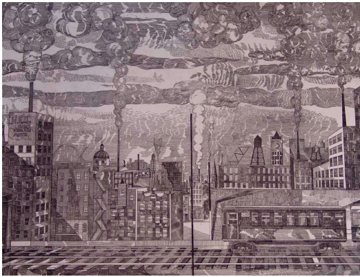
Lake Street II , Etching, 18 x 24", E 5,6/50 2010, A.P. 5/50 1984, 9,10/50 1982, JAK123