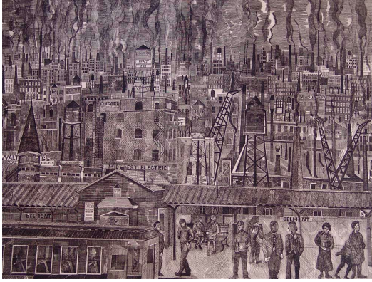
Dark Afternoon , Etching, 18 x 24", E 50/50 2010, JAK118