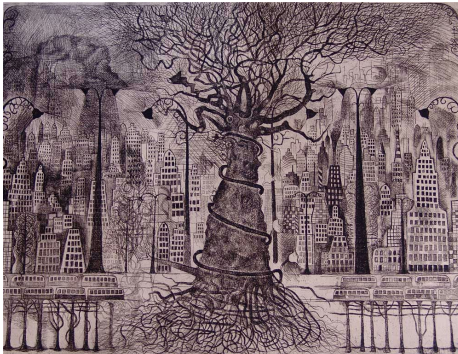
The Tree , Etching, 18 x 24", 5/50 2010, 10/50 1980, 7/50 1980, 1 edition, 8/50 2010, 7/50 1980, 44/50 1982, 3/50 1980, 15/50 2009, 1 edition, 15/50 1985, A.P. 1979, JAK493