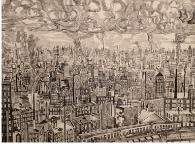
Untitled , Etching, 18 x 24", JAK495