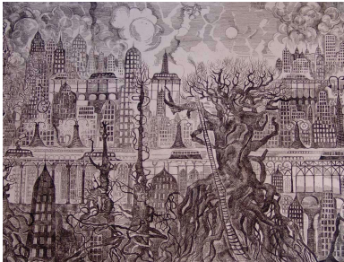
The Ladder , Etching, 18 x 23", E10/50, 3.26.86, A.P 1982, 5/50 2010, 6/50 2010, '82 (damage), 11/50 1995, JAK492